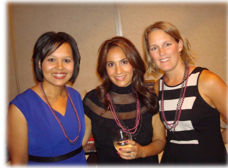
Seen at 2015 Gala: Alexandra's House Moms